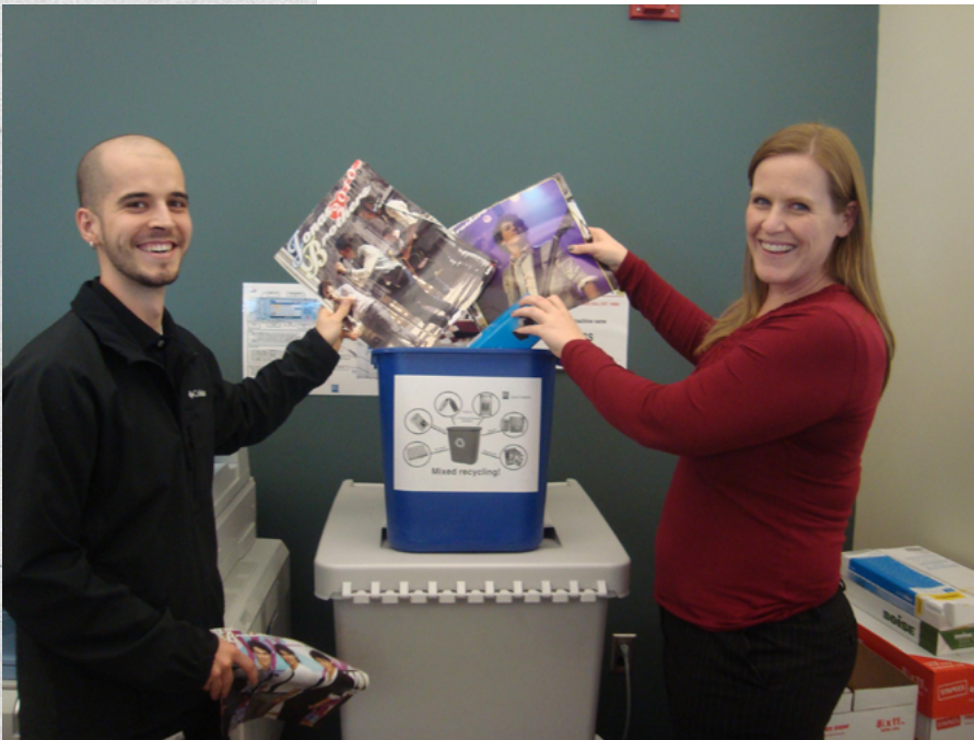
State Street enhances their recycling program through employee engagement

ways. State Street's Office of Environmental Sustainability uses an internal social networking site to reach out to employees. The office also engages employees through surveys and quarterly updates regarding the company's ISO 14001 certification for environmental management. An employee dashboard that includes waste and recycling information for key sites is also published quarterly. State Street understands that their programs must continue to evolve and is committed to constantly evaluating program execution, waste receptacle containers and locations, and communication streams.