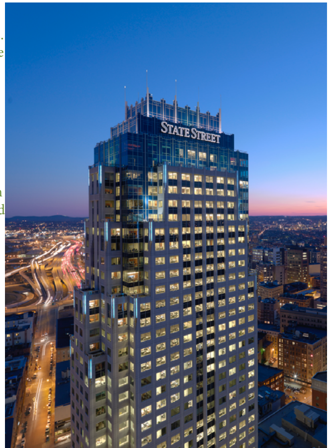
State Street's Boston Headquarters

Challenge/Solution: State Street's biggest waste and recycling challenges are related to staff behavior. End users are in control of how they handle waste for recycling. It is important to make sure they are aware of the guidelines and understand what to do with the different materials. The company addresses this issue in a variety of