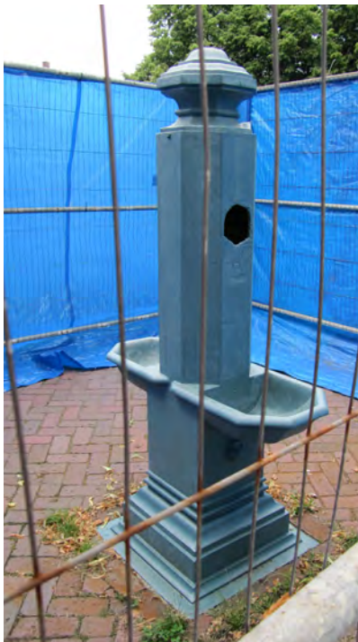
The old fountain after being repaired and primed.

One problem that was discovered after the pickets were removed was that many of the pickets rusted away in their concrete bed, shortening the usable length of the picket. After sorting through the pickets the contractor came up with two solutions to remedy the short-picket dilemma. 152 pickets were just long enough to reach the new concrete capstone, but did not extend far enough into the concrete to anchor the fence. For those pickets an extension stud was pinned to the bottom of the picket. Although the new extension is unattractive, it will be hidden in the concrete and will not be visible. 110 pickets were too short to even reach the capstone, so an extension stud could not be used because it would be visible. Short pieces of round steel bar stock were stick welded to the bottom of these pickets. It is difficult to weld things to cast iron. In order to make the welds sound, stick weld with nickel alloy was used. The pickets and extensions were heated to over 400 degrees and were then cooled in a refractory material, which cools off very slowly. This procedure prevents cracking along the new weld. Finding matching octagonal bar stock was very difficult. After much searching the contractor managed to locate a cache of octagonal gun stock from a supplier in Missouri and quickly bought it all up. The extra work required to lengthen the pickets will add an additional cost of $21,707 to the contract.