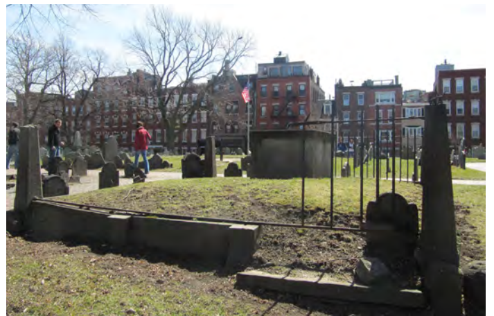
The contractor is forging new pickets for the fence around this tomb. The granite base will be straightened out .

The contractor is just now starting to reinstall the new fence. It takes one full day to install two panels. Most of the work should be completed by the first week in October. The final installation of the bird spigots will be a little later this year. I know the final result will be fabulous!