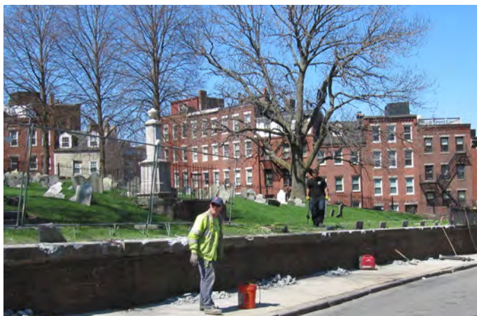
Workmen removing the cast-iron fence from the wall. The capstone was removed later.

The January 2013 edition of this newsletter included an article about the design process for the restoration of a historic cast-iron fence at Copp's Hill Burying Ground. This project is now under construction and due to be finished this fall. As per state law, this project was put out for public bidding at the beginning of January 2013. Four responses were received from bidders. The low bid for the project was Sequoia Construction, Inc., who came in at $260,150. The highest price was $590,159. There were four add alternates included in the project and we accepted all four of them.