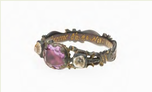
This is a funeral ring for Rufus Greene who died in 1760. He is buried in a tomb in the Granary Burying Ground.

In general the funeral descriptions recorded in diaries or newspapers are for people of high economic and social position. But what about people of lesser economic means? Did they have lavish funerals too? Without primary source documentation it is difficult to answer this question. However, in 1721 the Massachusetts legislature thought it was necessary to pass an act designed to restrain spending at funerals. The act said: "Whereas the charge or expence of funerals in later years (when the circumstances of the province so loudly calls for all sorts of frugality) is become very extravagant,