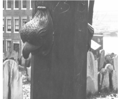
The bird's head spigot shown in this old photo is being recreated by an artist.

There are four add alternates to this project that are currently in various states of repair. These are items that are described in the construction documents and can be added to the final contract depending on the prices obtained in the bid. One fence has been removed for sandblasting and painting, but not reinstalled. Another fence has been sanded and painted on site. This fence is set upon a brick and granite base that requires some rebuilding. Woven Steel Inc. is forging new pickets for a third fence that also requires some landscaping around the base. The cracks in the 1840s cast-iron fountain have been repaired. It has also been sanded, primed and repainted black. Originally it had two spigots in the shape of a bird's head which disappeared at some point. An artist is recreating the spigots according to an old photograph of the fountain. The artist has currently completed the clay model of the replacement spigot. The spigots will be cast and reattached later this fall.