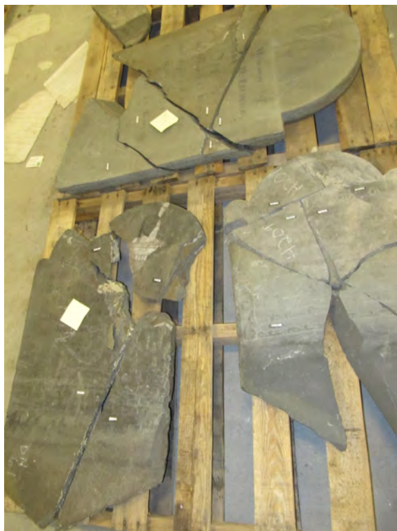
These stones require more complex conservation work.

is in the book, I could be certain that at one point it was in that particular burying ground. Sites such as Dorchester North, Eliot, and Phipps Street Burying Grounds, which were not part of the city of Boston until the latter half of the 19th century, are not included in this book. For Dorchester North and Eliot Burying Grounds I could use the notecards from the gravestone inventory from the late 1800s. These inventories are also reprinted in the Cemetery Department's Historical Sketch series from 1904. I do not have an early survey of Phipps Street Burying Ground. For that site I consulted The Genealogies and Estates of Charlestown, 1629-1818 , by Charles Wyman, which was originally published in 1879. The listings in this book are organized by original family name, with all the family members