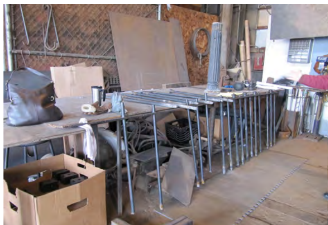
When the fence pickets are lined up in the shop, it is easy to see that some pickets are severely eroded at the bottom.

and the capstone fell apart, exposing the bottoms of the pickets. Cast iron is a brittle metal and can break easily. One area of concern in this project was that some of the pickets might break during the removal of the fence from the capstone. The operation was successful and very little breakage occurred. One small problem occurred with the removal of the capstone. In some areas of the supporting wall, one or two courses of bricks came off with the capstone. An inspection of the wall made it clear that water infiltration from behind the wall had caused a crack to form underneath the bricks