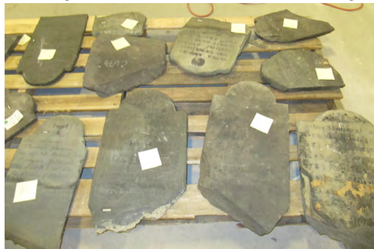
These headstones are too short to be reset. Another piece of stone must be attached to the bottom of the headstone to lengthen it.

One important question that arises with every gravestone that is not 100% complete: is the rest of the stone still in the site? If the bottom of the stone is still in the site than it will be a perfect match to the top and the conservator will not have to attach a new piece of stone, which will never match as well as the original. Also the epitaph will be fully readable, from top to bottom, instead of an incomplete inscription. For a fragment of a headstone, such as the one on page 9, finding the rest of that stone in the site makes the difference between returning it to the site or keeping it in storage. Without the rest of the headstone, that fragment is too small to be reset in the ground. If the other part