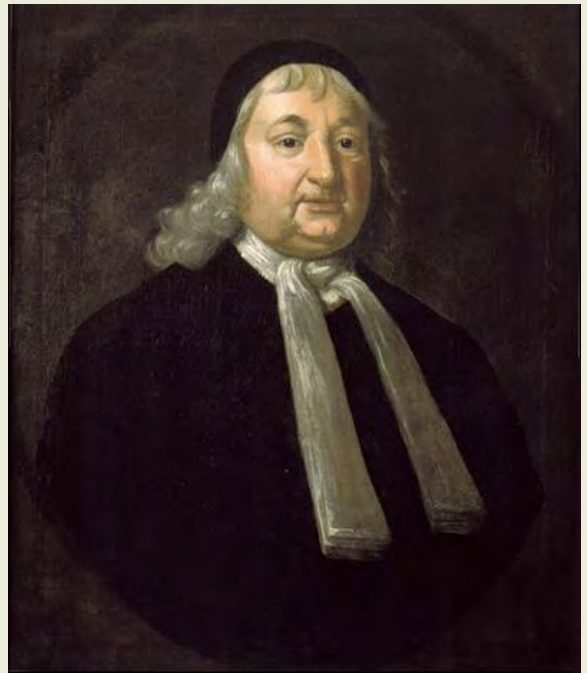
A 1729 painting of Samuel Sewall by John Smibert. Both men are buried in the Granary Burying Ground.