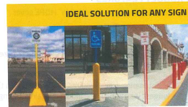
IDEAL SOLUTION FOR ANY SIGN