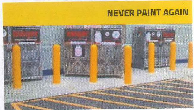
NEVER PAINT AGAIN