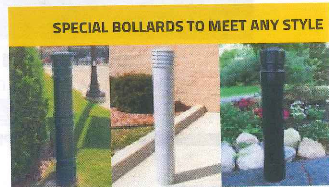
SPECIAL BOLLARDS TO MEET ANY STYLE