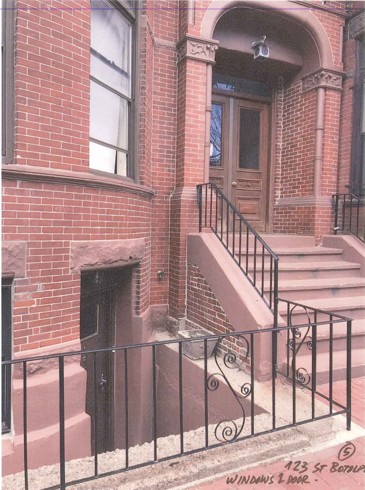
⑤ 123 ST BOTOLPH WINDOWS & DOOR.