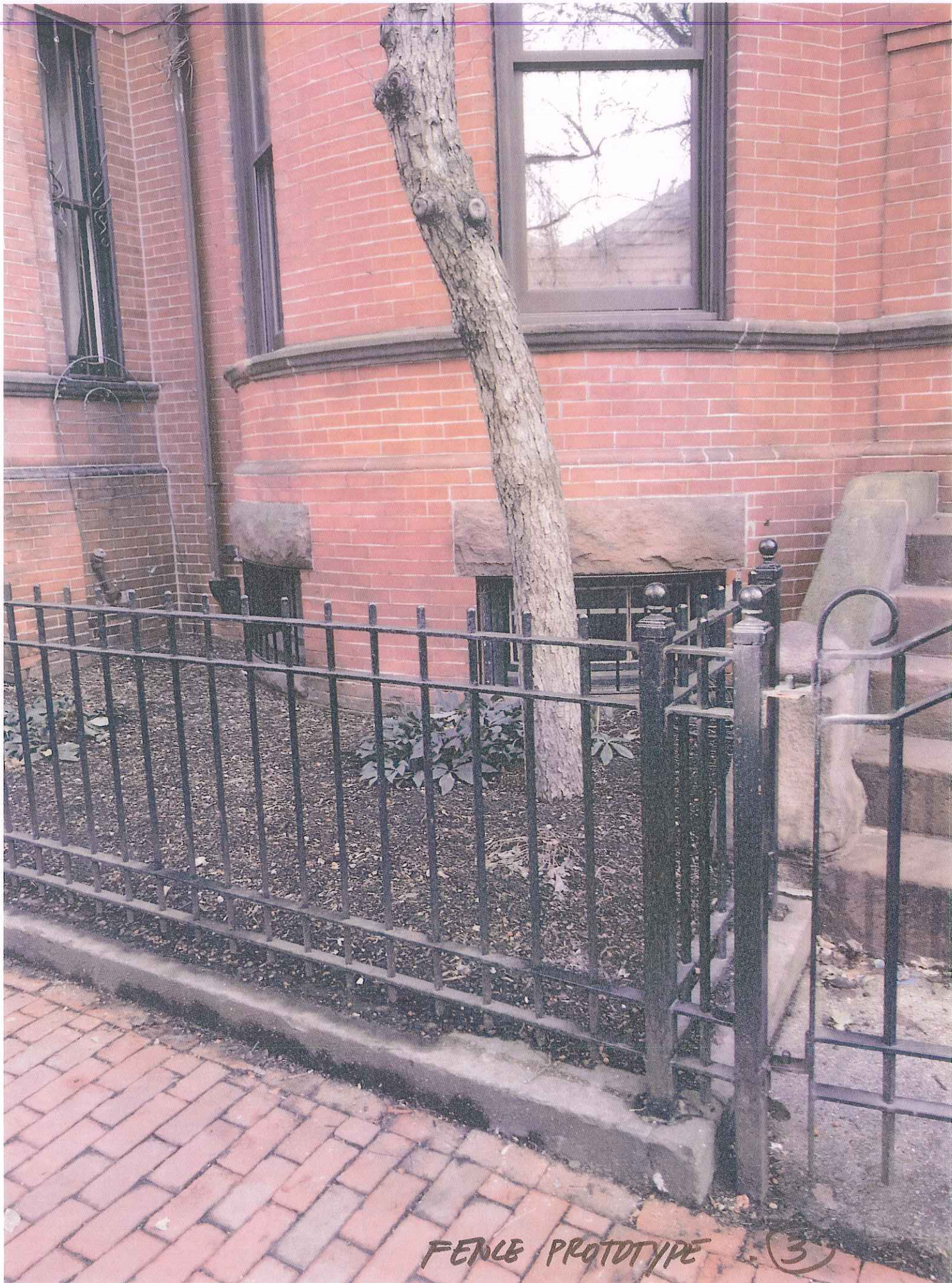
FENCE PROTOTYPE 3