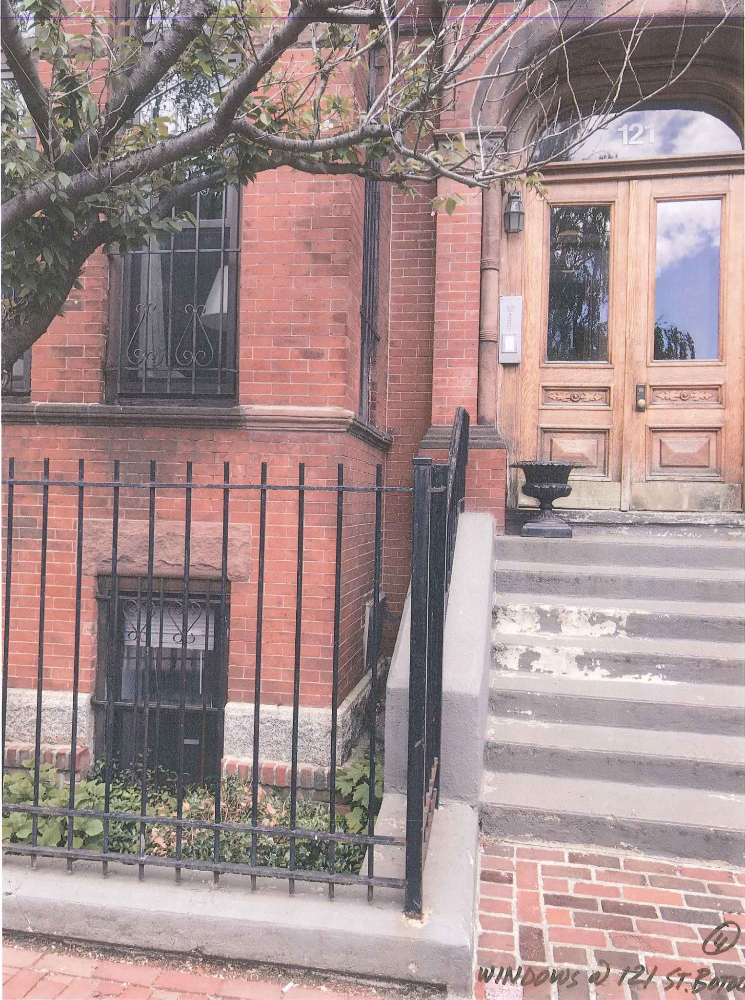
④ WINDOWS @ 121 ST. BOTOLPH