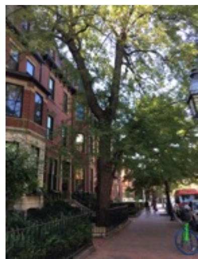
65' tree 3 bldgs to left of us