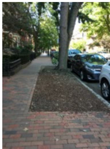
roots of tree in front of us