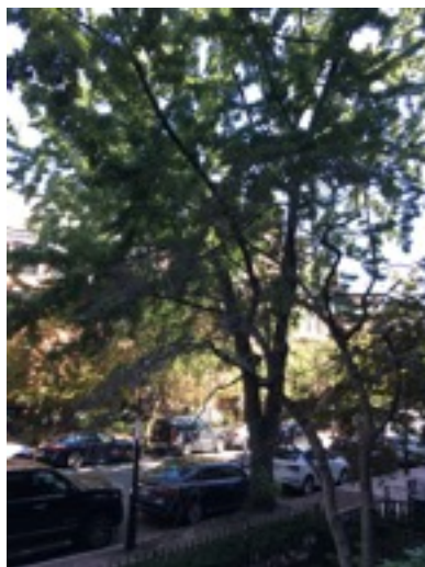
60' street tree in front of us

I planted the magnolia that has died 30 years ago. It never did well and barely flowered, because our garden is overshadowed by enormous street trees on either side of us, which block all the sun and take much of the water.