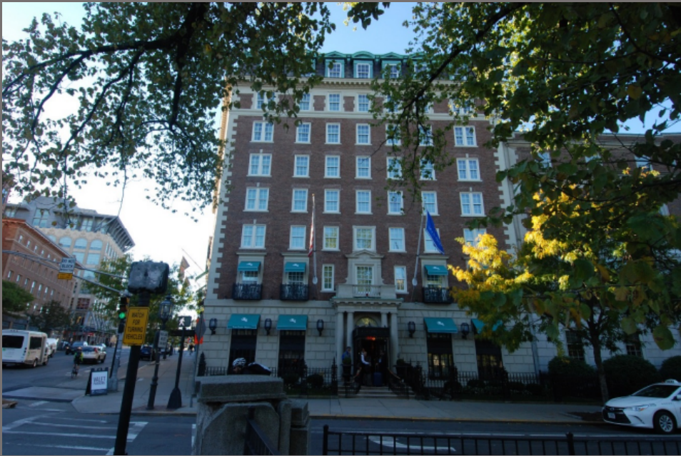
COMMONWEALTH AVENUE ELEVATION