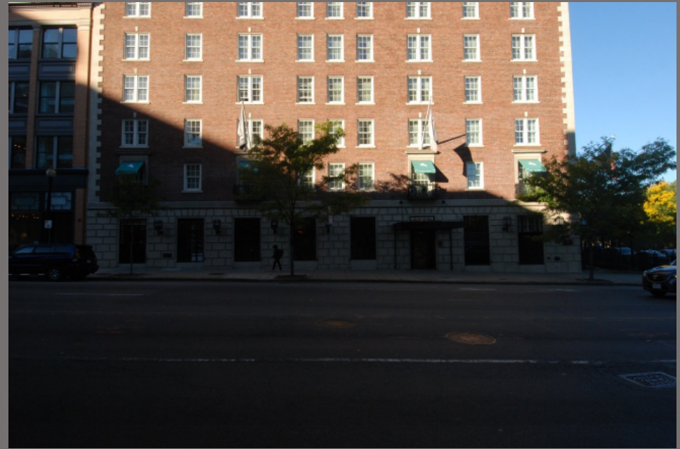
MASSACHUSETTS AVENUE ELEVATION