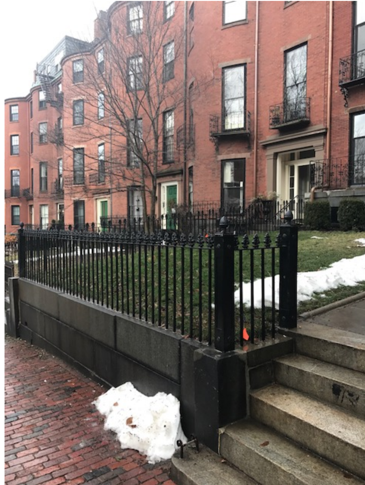
73 MOUNT VERNON - Existing Photos October 2017