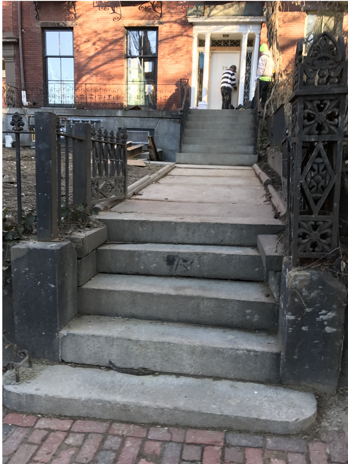
73 MOUNT VERNON - Existing Conditions Entry Photo March 2017