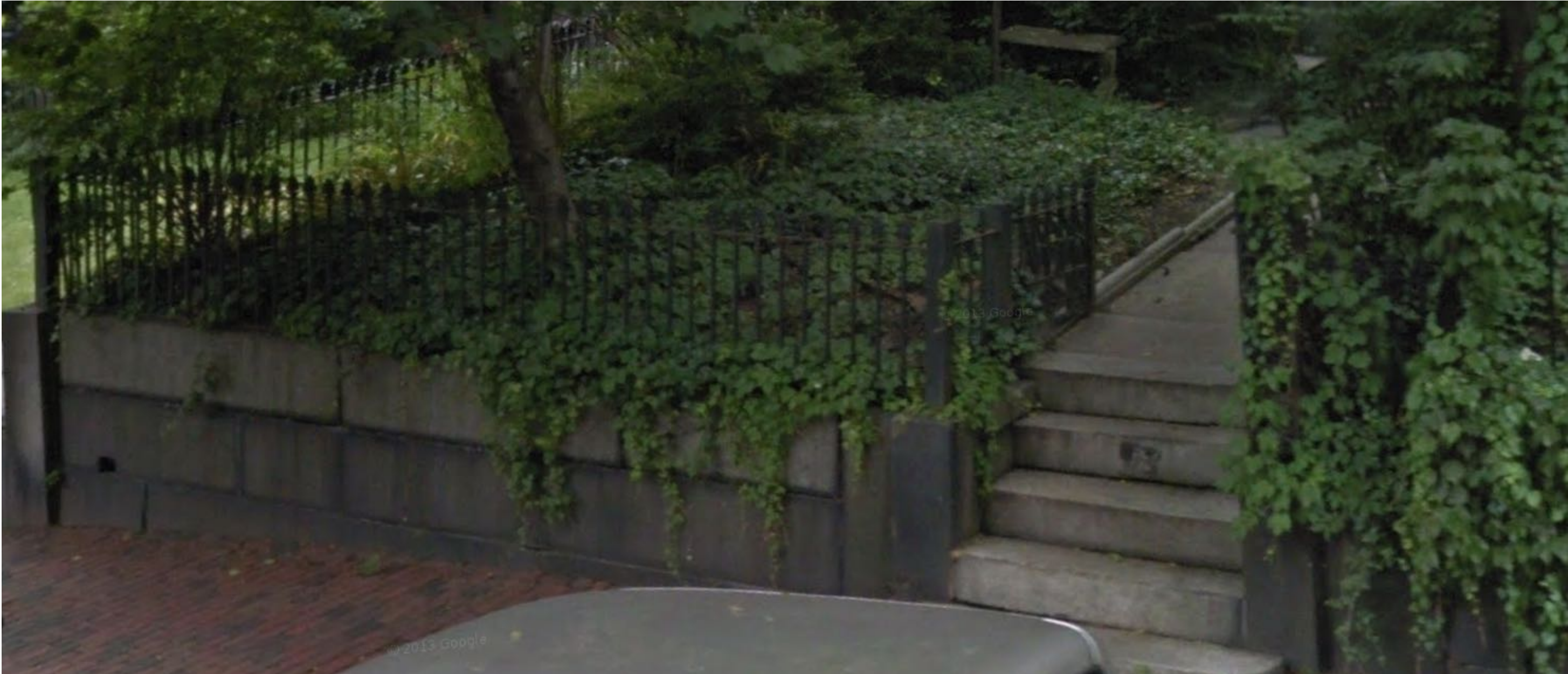
73 MOUNT VERNON - Enlarged Photo June 2011