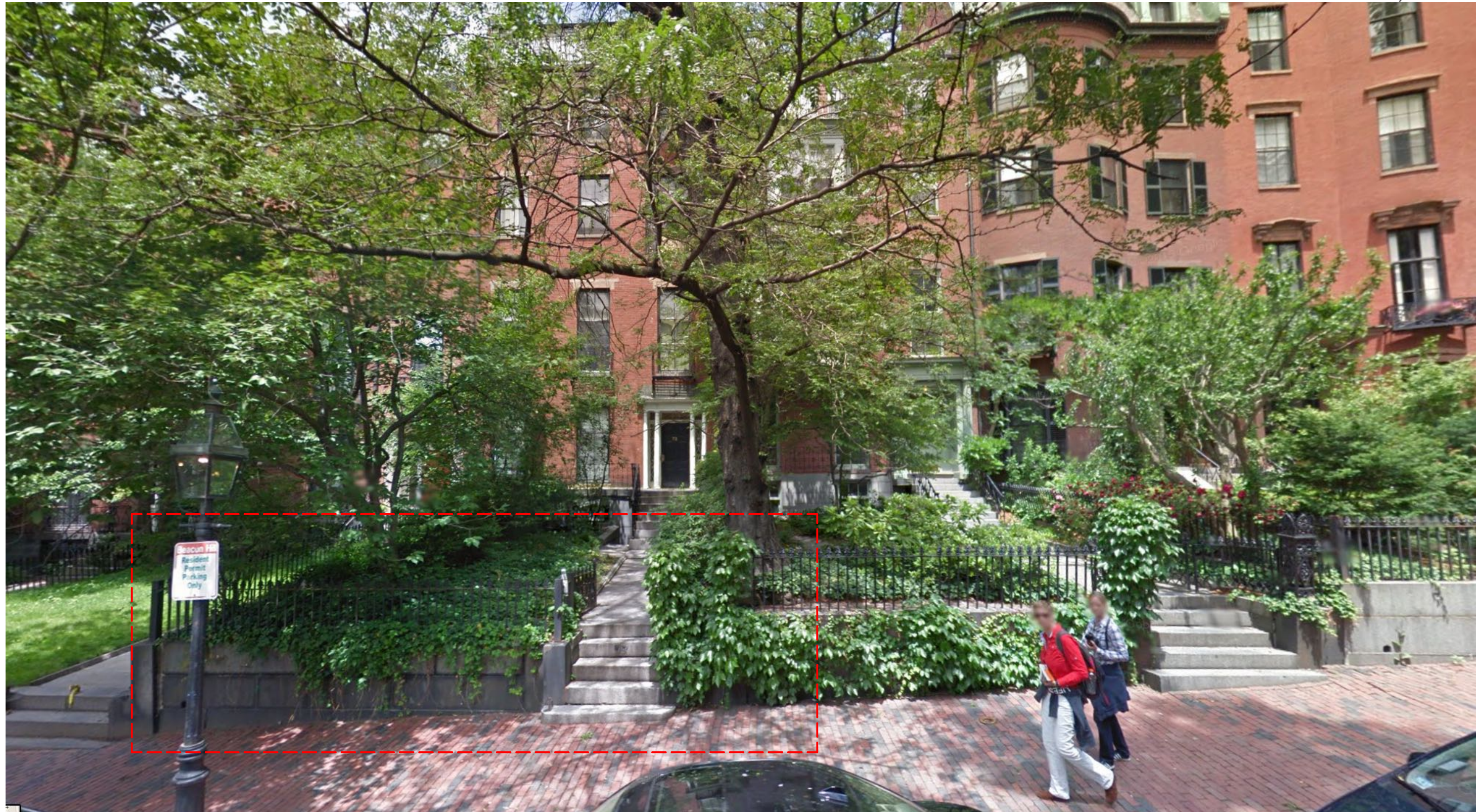
73 MOUNT VERNON - Existing Conditions Overall Photo May 2016