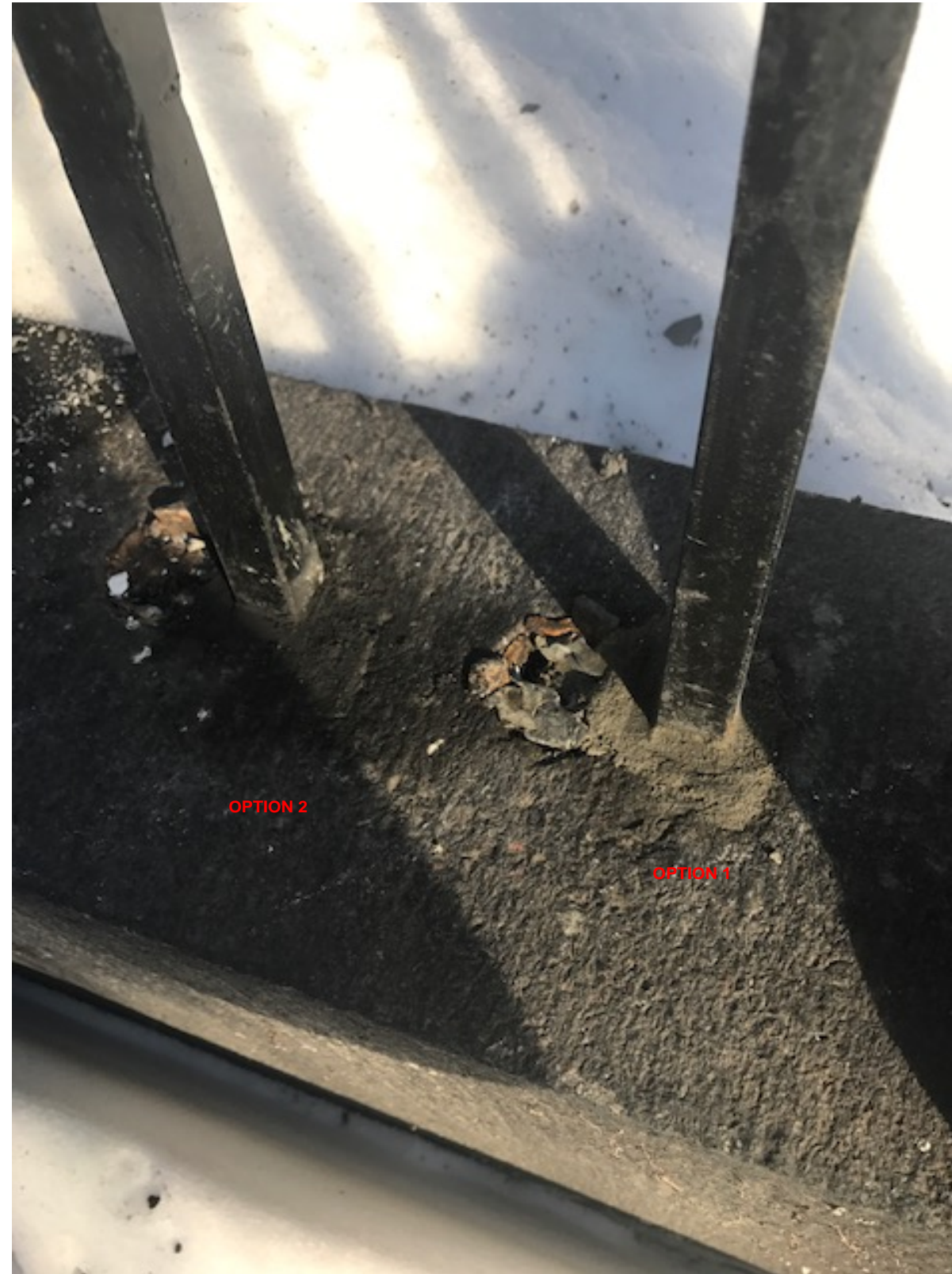
73 MOUNT VERNON - Stone Repair Mock-up