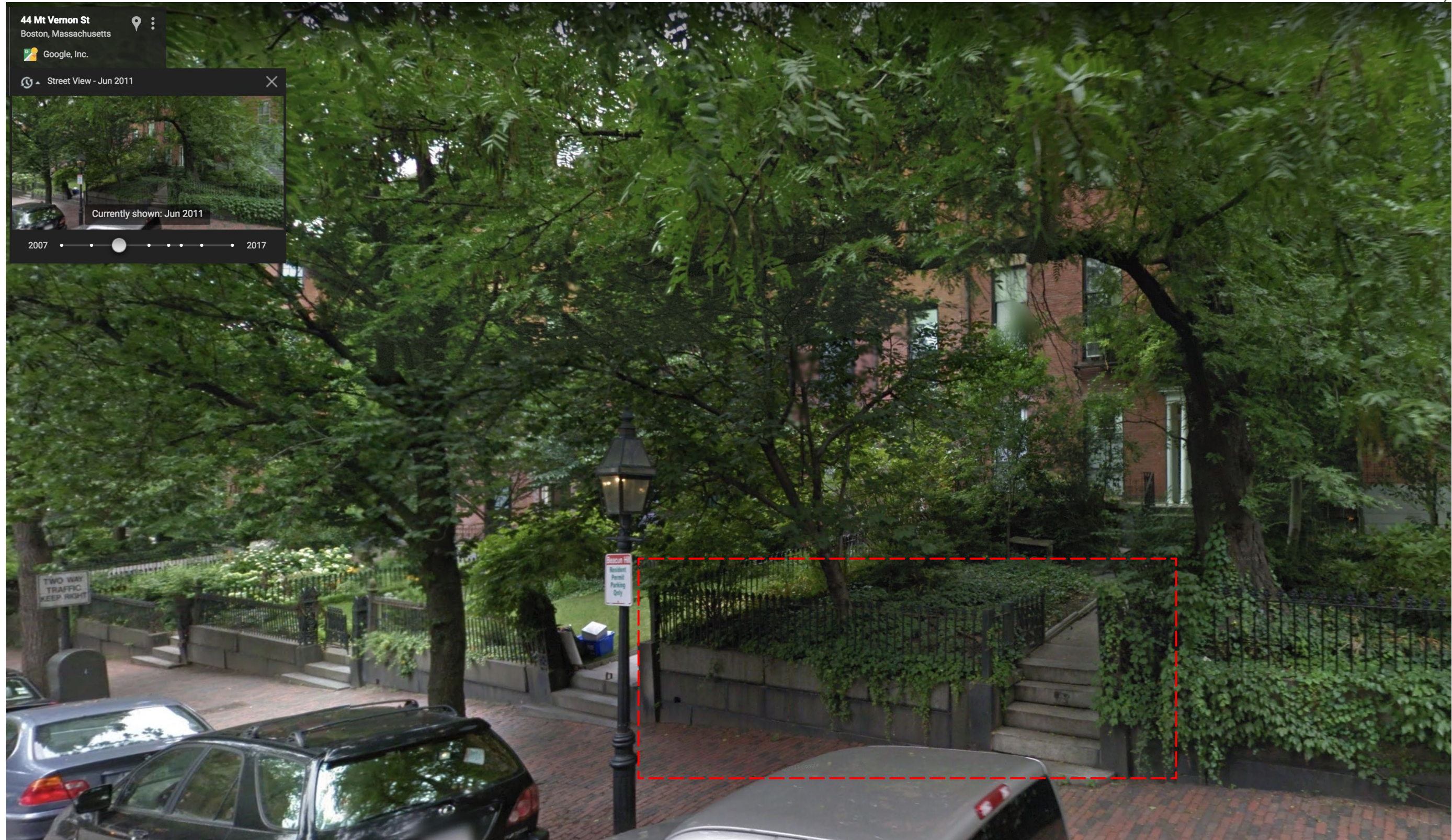
73 MOUNT VERNON - Existing Conditions Overall Photo June 2011