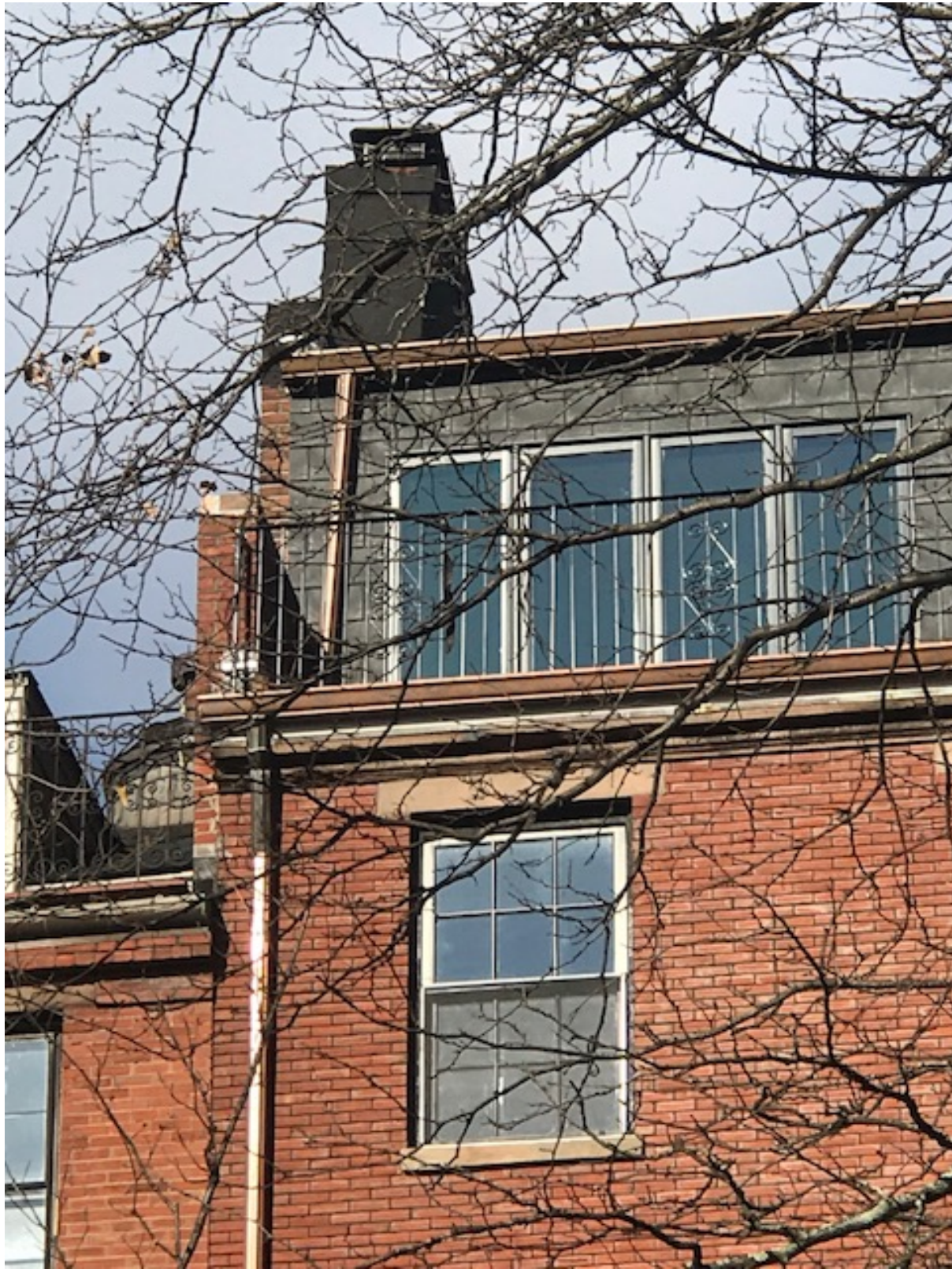
73 MOUNT VERNON - Chimney Cap