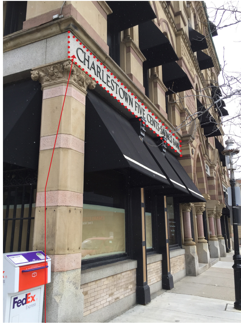
B 9 1/2 INCH FLUSH MOUNTED DARK BRONZE WORDMARK FINISH: DARK BRONZE TO MATCH EXISTING