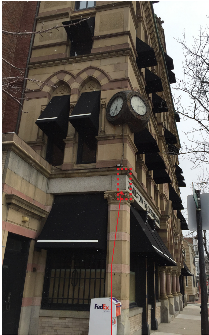
A 24 INCH NON-ILLUMINATED CORNER BLADE SIGN