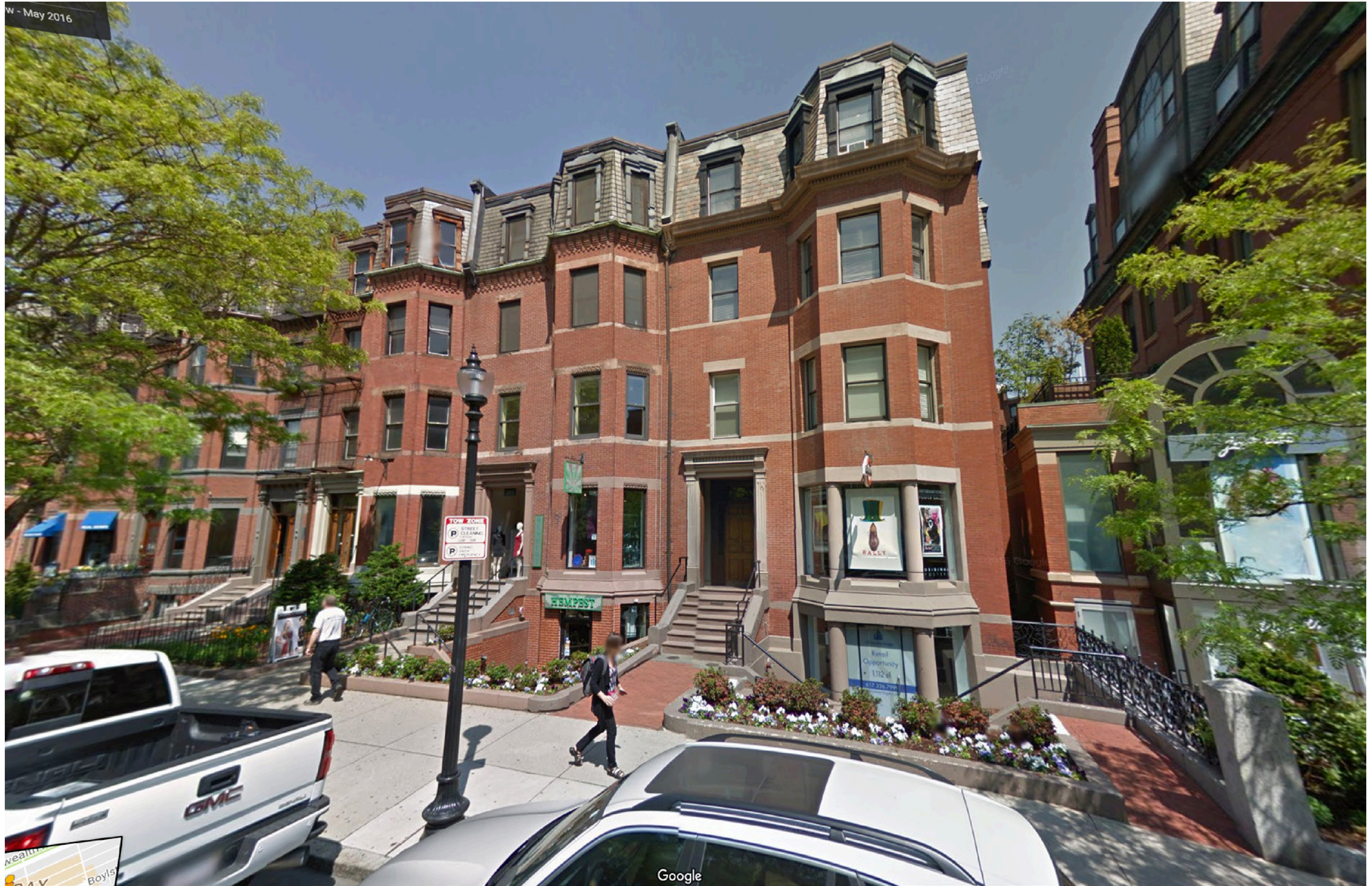
205-207 NEWBURY STREET - EXISTING STOREFRONT