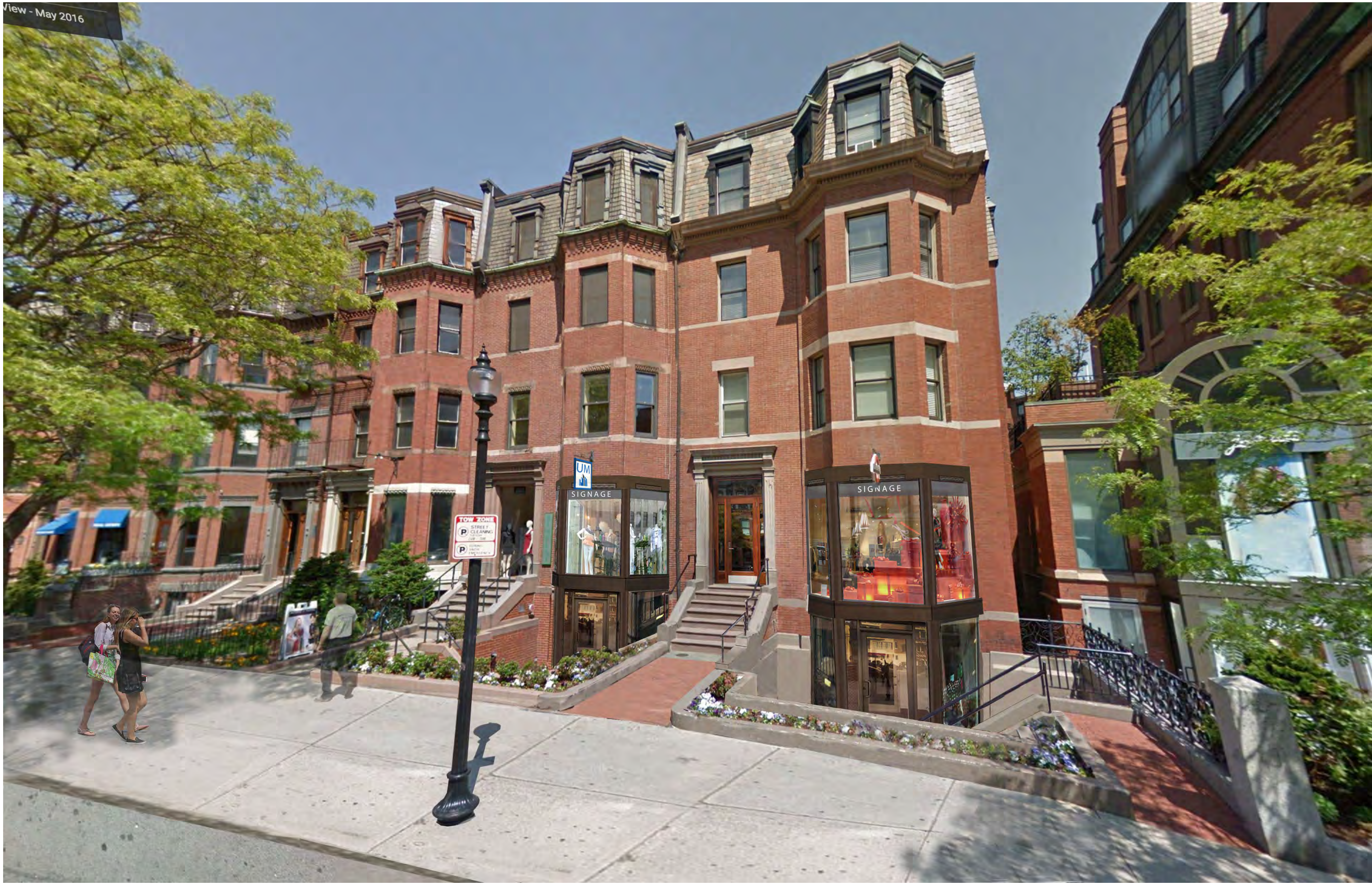
205-207 NEWBURY STREET - PROPOSED STOREFRONT