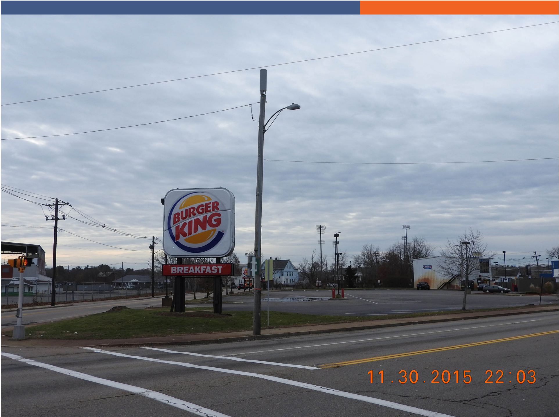
Proposed Conditions: Wood utility pole with equipment & top mounted antenna.