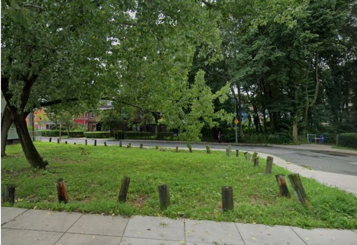
View of 43 Wenonah Street (from Waumbeck St.)