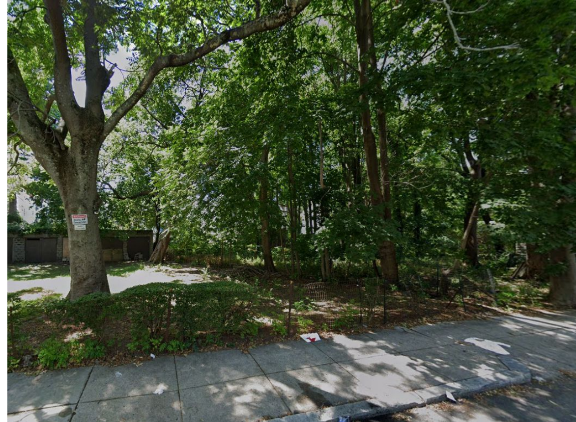
View of 46 Wenonah Street