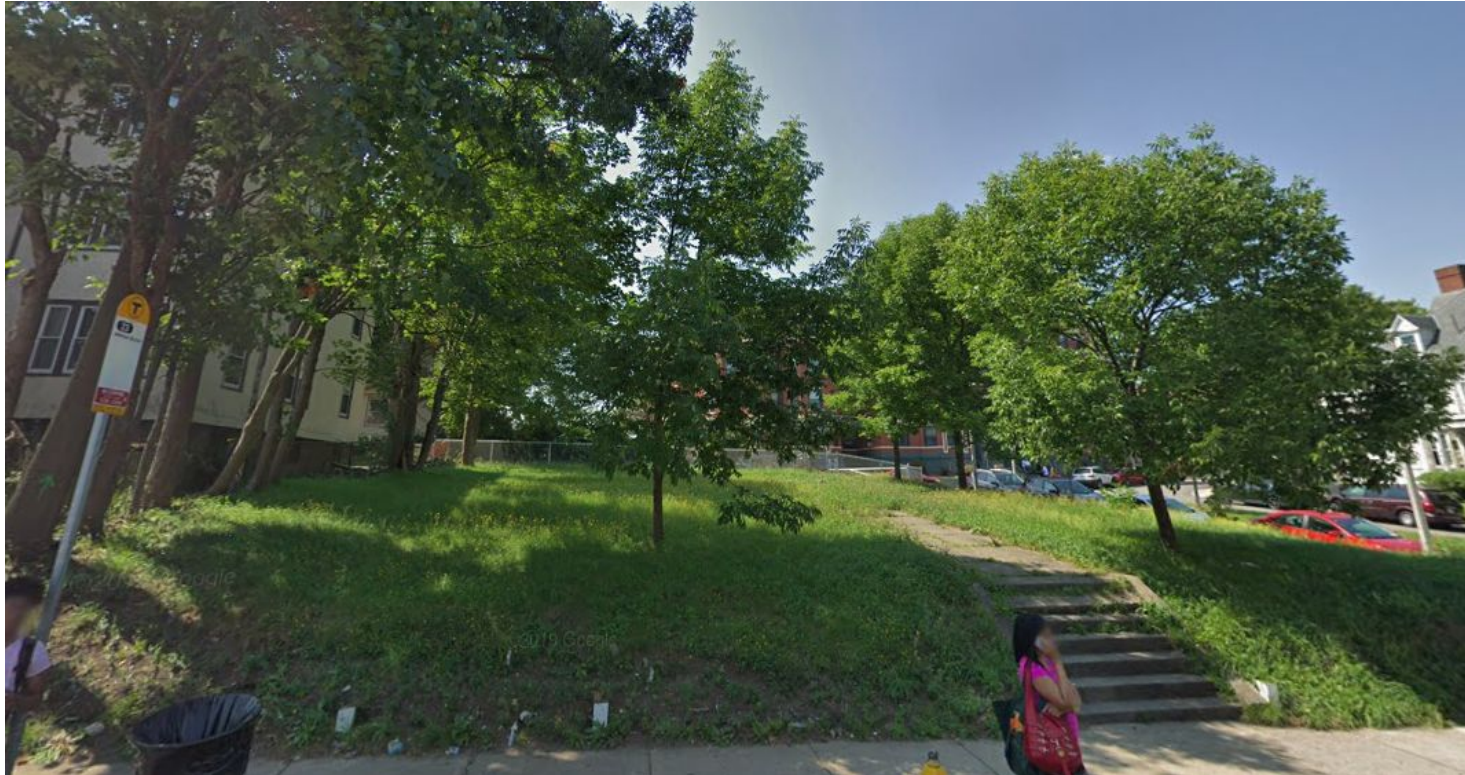
View from Washington Street