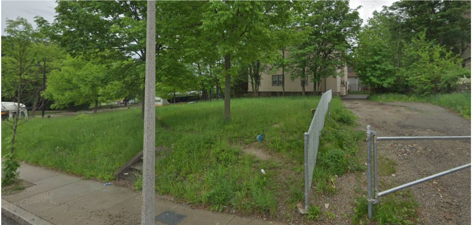
View from Bradlee Street