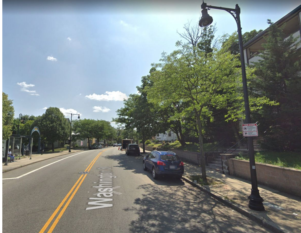
View looking south on Washington Street