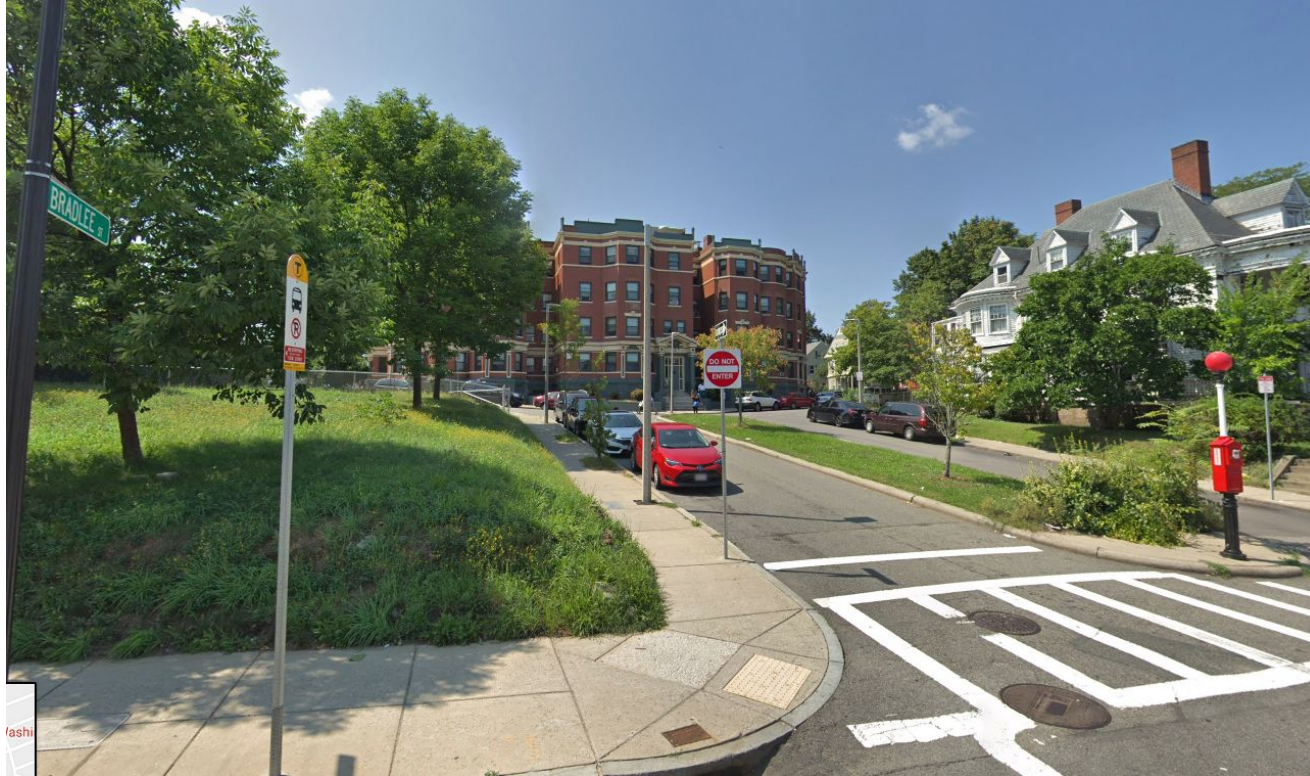
View looking down Bradlee Street