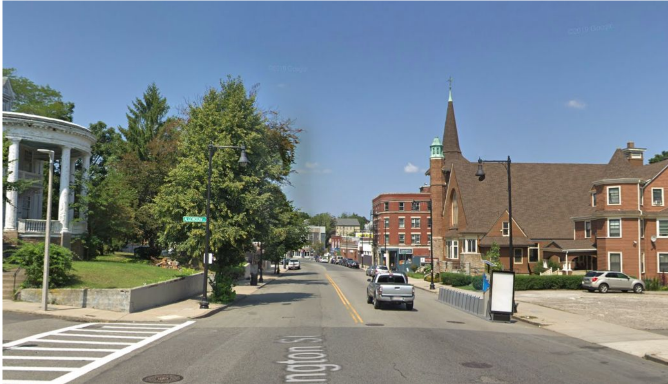
View looking north on Washington Street