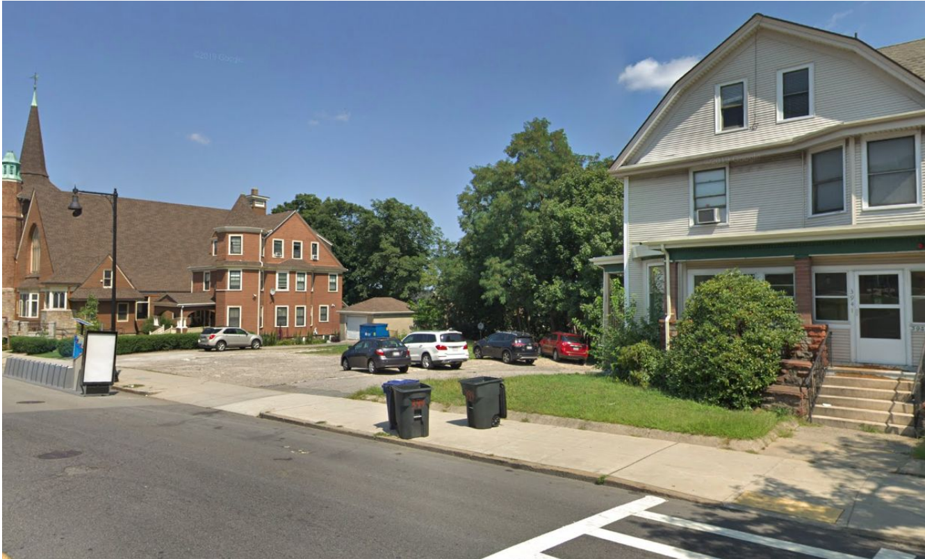
View across the street on Washington Street