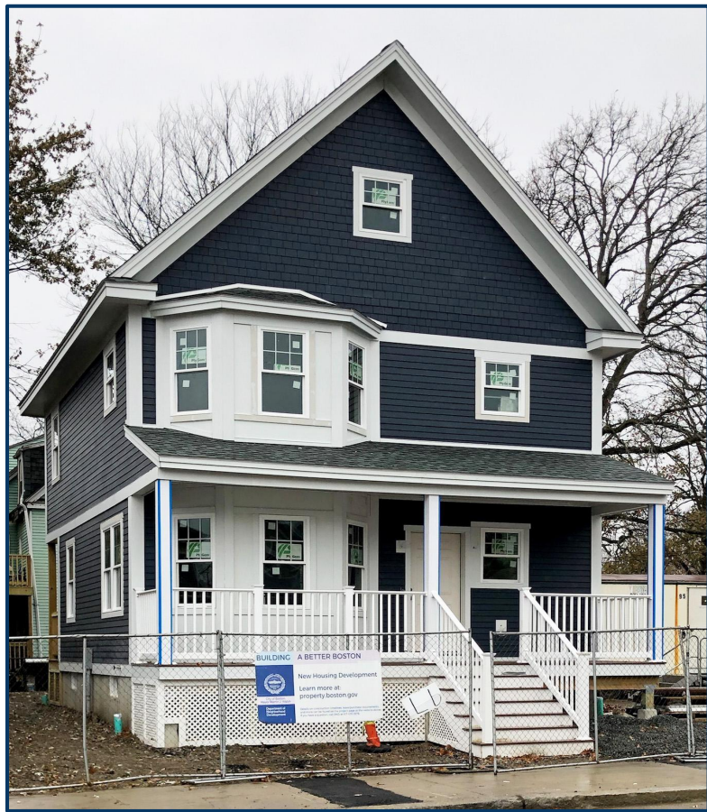
Neighborhood Homes Initiative: 2 family homeownership + rental unit