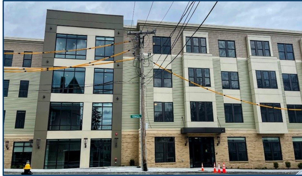
Hearth at Four Corners: completed, rental