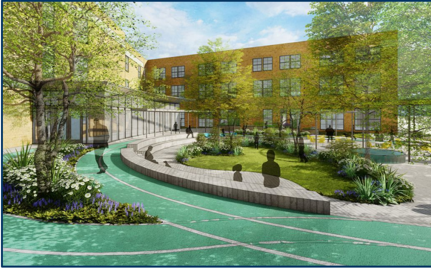
Barton Rogers School: The Pryde LGBTQ senior housing adaptive reuse, rental